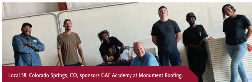
Local 58, Colorado Springs, CO, sponsors GAF Academy at Monument Roofing.