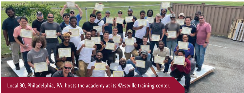
Local 30, Philadelphia, PA, hosts the academy at its Westville training center.

in federal prison and learned about the program through a job fair. He said the GAF Roofing Academy has given him a chance to change his life around. "I gave the streets 100 percent; I'm ready to give a job 100 percent now. I was putting my 100 percent to the wrong place. I'm trying to change that and work and make something different out of my life," he said.