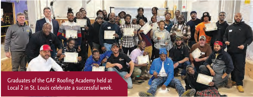
Graduates of the GAF Roofing Academy held at Local 2 in St. Louis celebrate a successful week.