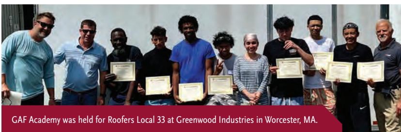
GAF Academy was held for Roofers Local 33 at Greenwood Industries in Worcester, MA.