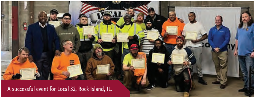
A successful event for Local 32, Rock Island, IL.