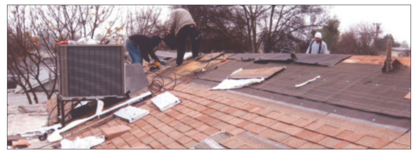
Local 27 Apprentices go to work on Brother Gonzalez's roof.