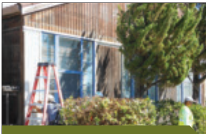
Local 81 roofers and waterproofer begin to install the new protective siding.

The Rio Vista Senior Center exterior was weatherproofed last year by volunteers from the Valley Roofers & Waterproofers JATC, along with the help of journeymen from Solano County Roofing, Kodiak Union Roofing Services and Kings Roofing.