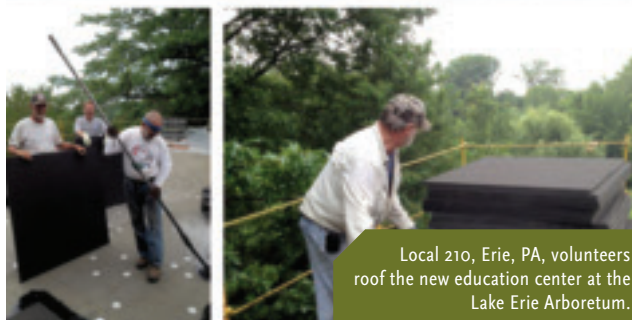
Local 210, Erie, PA, volunteers roof the new education center at the Lake Erie Arboretum.