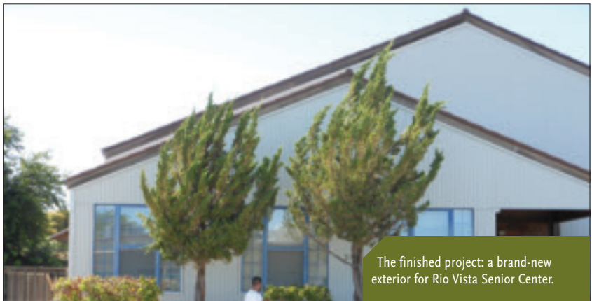
The finished project: a brand-new exterior for Rio Vista Senior Center.