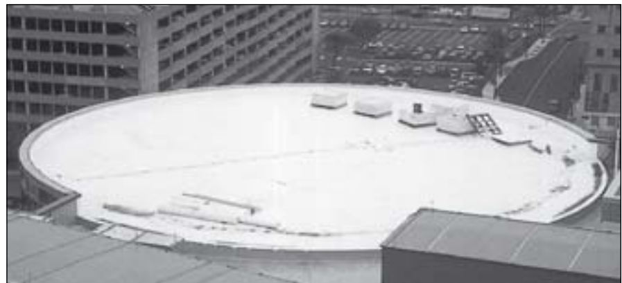
The north cylinder entrance upon completion.

Local 4 representatives were invited to attend opening night of the New Jersey