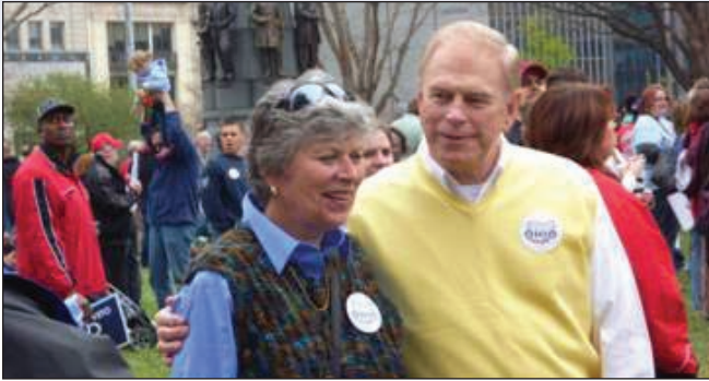
Former Democratic Ohio Governor Ted Strickland and his wife attend the Columbus rally against SB5 on April 9.