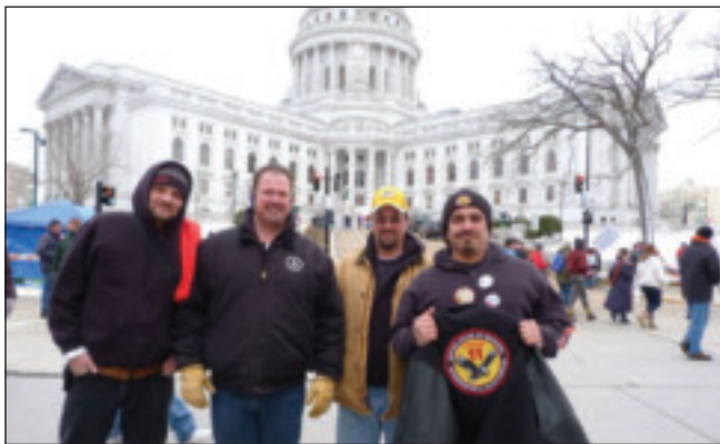
Members of Roofers Local 11, Chicago, IL, make the trip to neighboring Wisconsin to show support for their fellow union members.