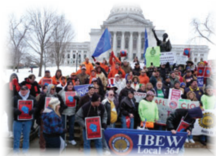
Building Trades union members gather in Madison, WI, to participate in a labor rally in March.

Who could have imagined the destructive legislative actions we've seen this winter and spring? From attacks on public employees in the Midwest to right-to-work and anti-prevailing wage legislation being pushed across the nation, rights that unions have worked for decades to gain are being threatened every day. Elected politicians are ignoring working families' No. 1 priority—jobs and the economy—to deliver political payback to the CEOs and corporations that bankrolled them into office.