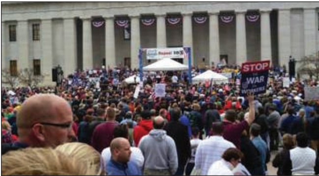
The "Repeal SB5" rally in Columbus draws huge attendance.