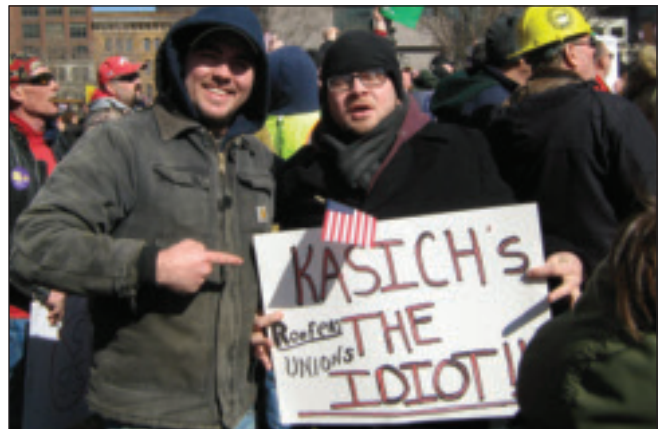
Members of Local 242 attend a rally in Columbus, OH.