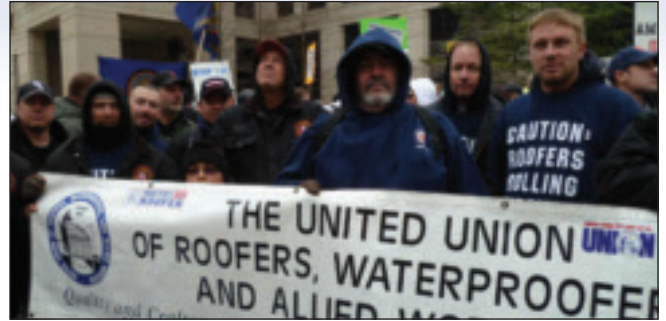
Members of Local 26, Hammond-Gary, IL, proudly display their local banner at the rally.