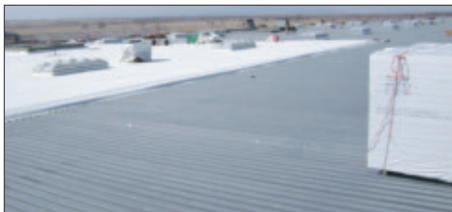
Metal decking before it's covered with insulation.