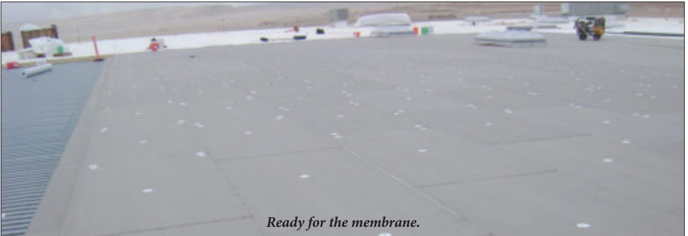
Ready for the membrane.

Its location in Colorado is significant because it will allow a larger percentage of components for wind power projects to be made in the U.S.A.