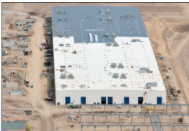
An aerial view of Vestas Towers with the white roof partially completed.