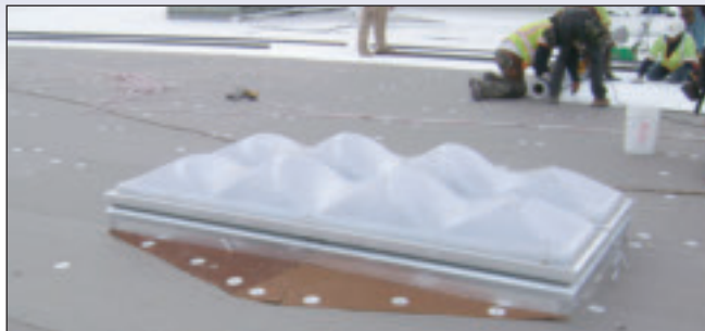
A close-up of the skylight and cricket on the Vestas project. Local 58 members begin rolling the TPO in the background.

We won’t know how much of an effect widespread white roofs will have until it becomes reality. But it might mean roofers have a whole lot of “white” in their future.