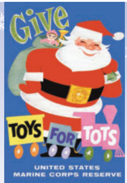
The original Toys for Tots poster from its inception in 1948.

This is the fourth year the Roofers have participated in the Toys for Tots drive, and each year has seen a significant increase in donations. If you would like to learn more about Toys for Tots, please visit www.toysfortots.org .