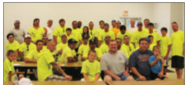
Local 11 volunteers relax before the celebratory BBQ begins.