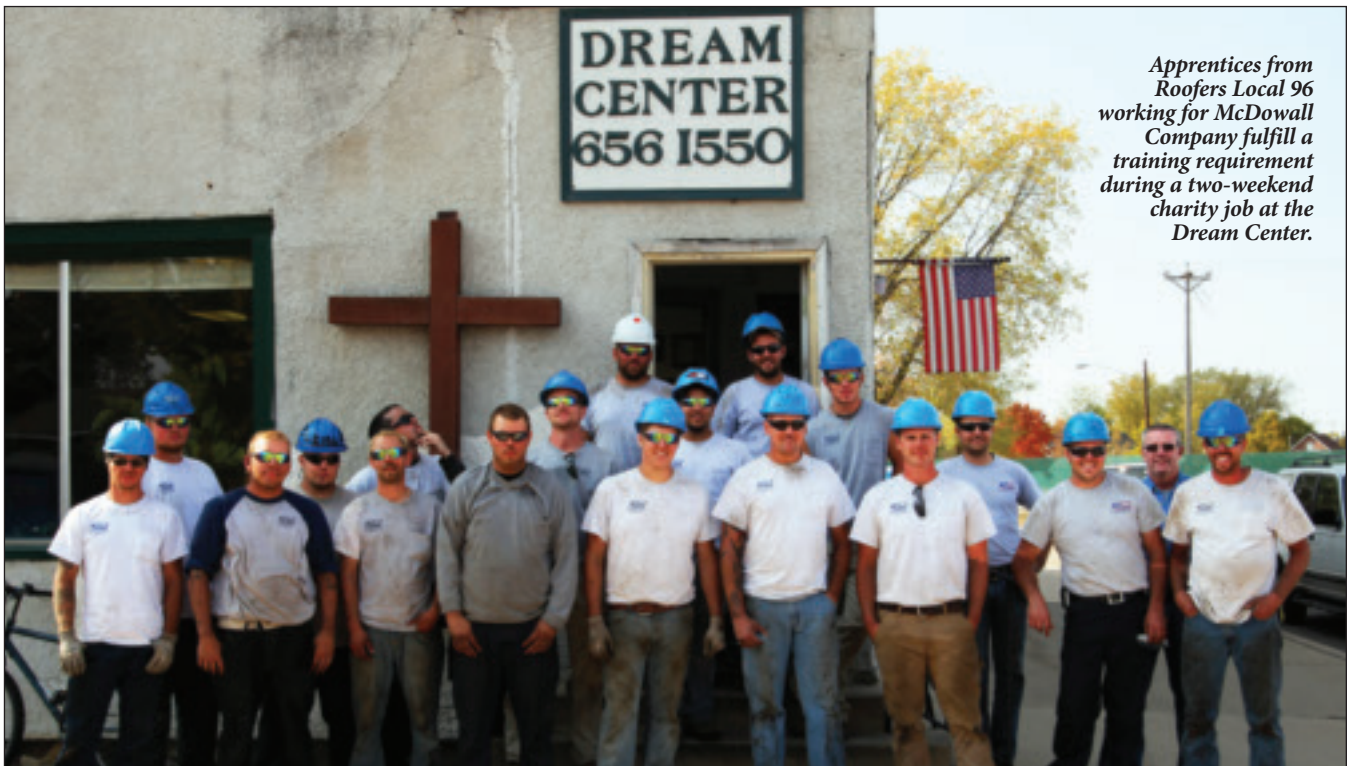
Apprentices from Roofers Local 96 working for McDowall Company fulfill a training requirement during a two-weekend charity job at the Dream Center.

Thanks to the Dream Center Apprenticeship Project and McDowall Company, Dream Center residents can continue to cross a Bridge To The Future.