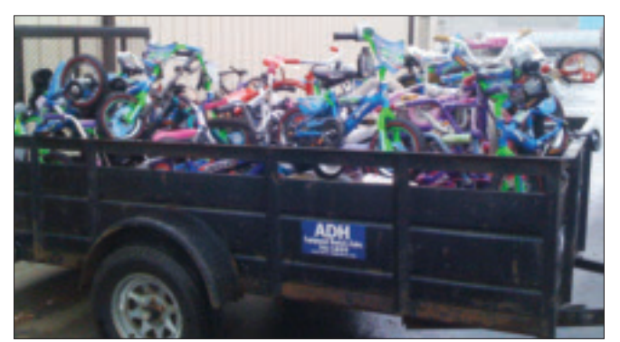
The bikes are loaded and taken to a storage unit until it's time to distribute them to the kids.

Soon organized labor started getting involved. Union members began to help deliver bikes, raise money and volunteer their time. "I can't tell you how